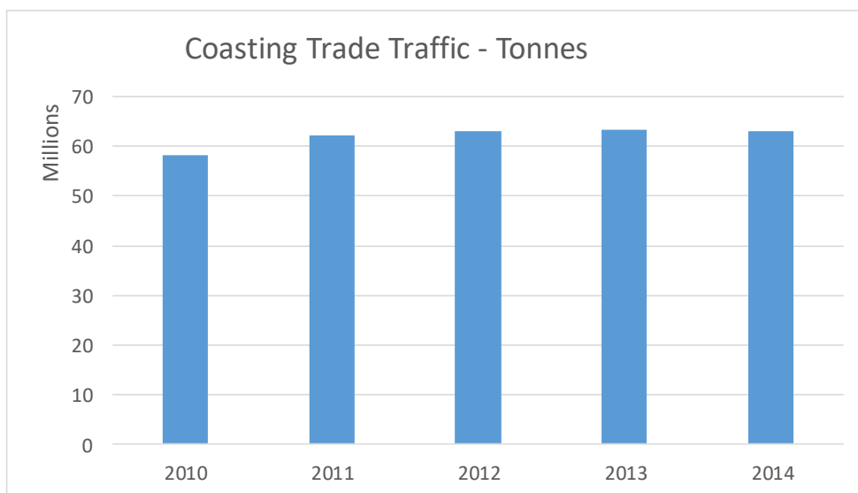
Figure App3- 1: Coasting Trade Trend